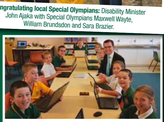
Croppa Creek Public School: Computer lessons for students.